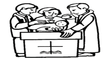
I baptize you in the name of the Father and of the Son and of the Holy Spirit

Why is harvest important? It is a time to give thanks to God for all that he provides for us. For the food we eat, the crops from our fields and the beauty of nature which surrounds us. It is also a time to remember those who do not have enough and to share our food with them. All masses on the weekend of 26th and 27th of October will be celebrated in thanksgiving of God's Harvest and the blessing he has given us.